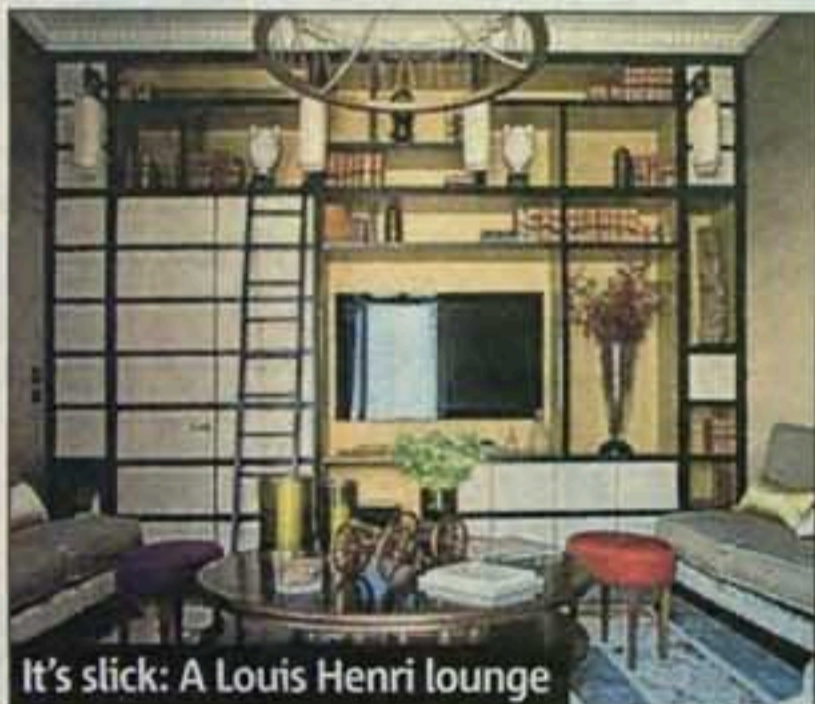
It's slick: A Louis Henri lounge

'What you don't want to do is have everything like ducks in a row on the same level, so group things together and ensure you get everything at different heights.'