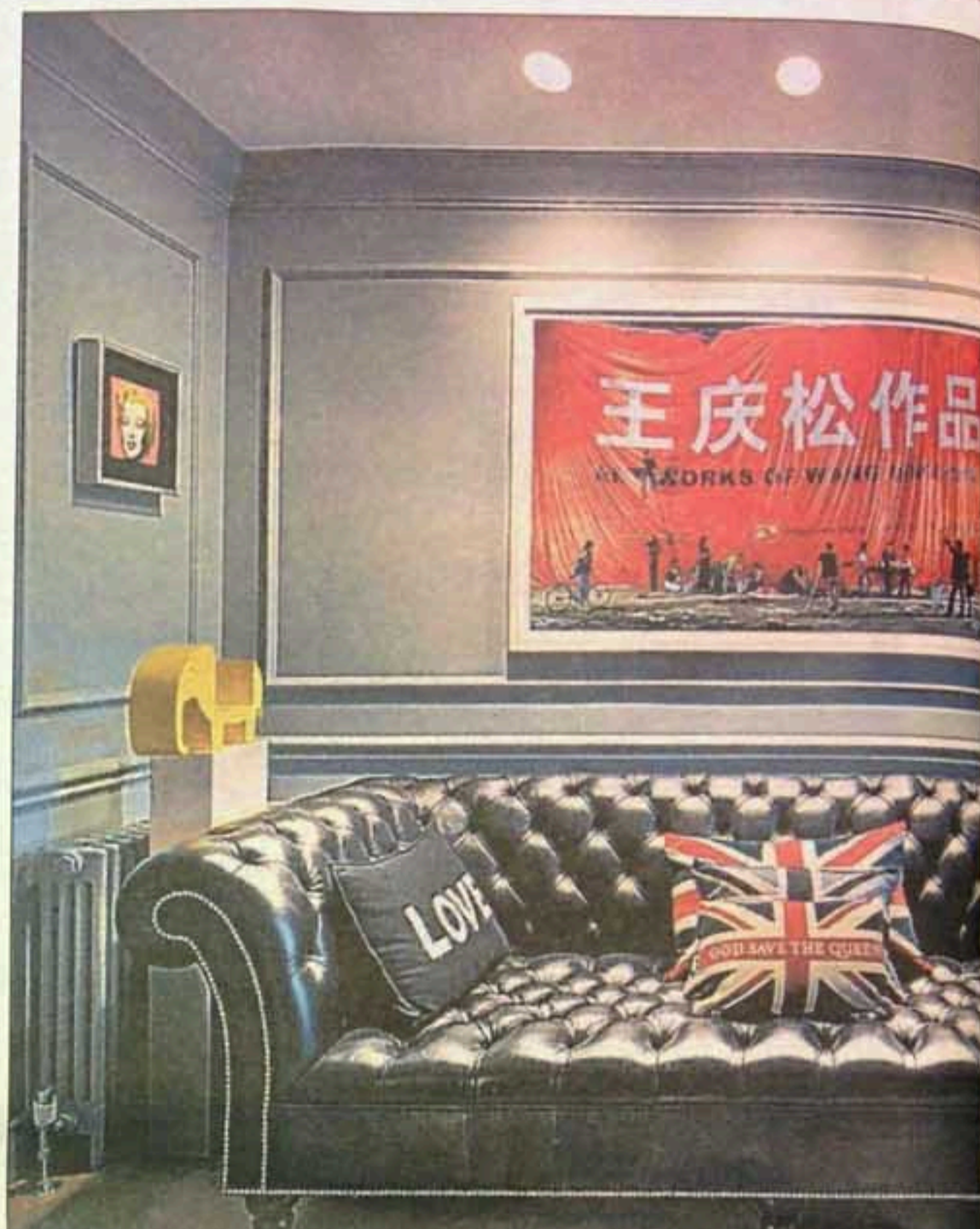
She's eclectic: Simone Suss suggests designing around an item you love

look of an 18th-century library with a wall of faux books and new squashy sofas.