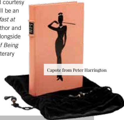
Capote from Peter Harrington