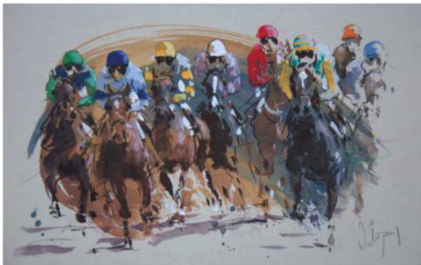
Above: 'Peloton' (The Pack). Below: 'White Horse'