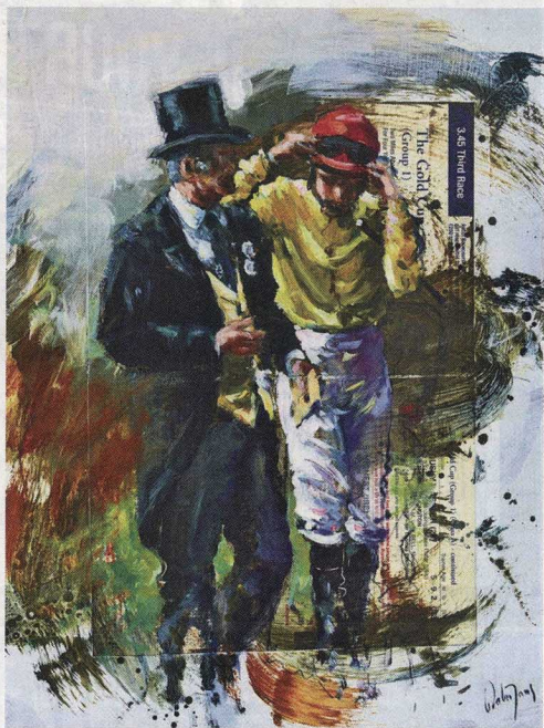
Royal Ascot features prominently in de Watrigant's latest exhibition in London

on-toast outlet on the grandstand lawn that it sold the equivalent of the height of the London Eye. There were 51,000 bottles of conversation and a more frenzied sound to the popping corks. All part of the soundtrack to a day on the Queen's racecourse.