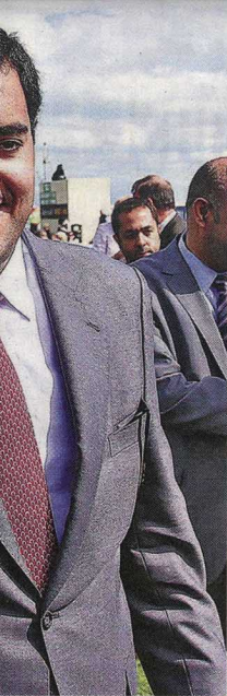
and utilises more than 20 trainers

It took a toll on him but he tried it with amazing grace and keen to ride in more charity as going forward.