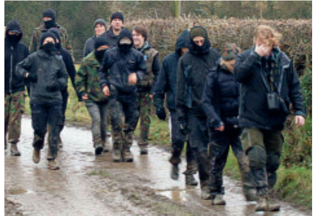
Police can order antis to uncover their faces, but this is rarely enforced